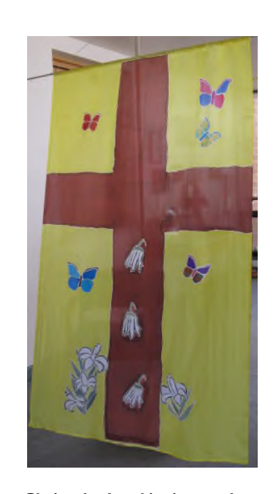
Christ the Lord is risen today: Hallelujah!